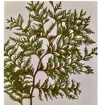
Thuja occidentalis (white cedar)