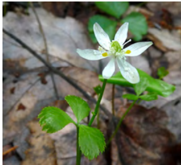
Threeleaf goldthread (savoyane)