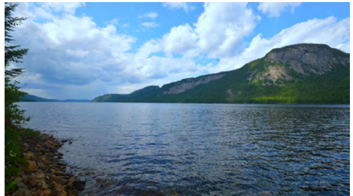
Ekiontarowänha (Batiscan Lake)

In 2019, the CNHW received a grant from Environment Canada for the realization of this project, which is being funded until March 2023. Among other things, this funding has made it possible to launch several sampling campaigns in collaboration with many partners to describe the wealth and uniqueness of the area to be protected. Thus, the CNHW has partnered with researchers in biology from the Université Laval, the Université du Québec à Montréal, the Université du Québec à Chicoutimi, the Canadian Wildlife Service, the Laurentian Forestry Centre and the Zoo de Granby, in addition to a researcher in economics from the Université du Québec en Outaouais and a researcher in archaeology from the Université Laval. Many research teams will therefore be surveying the territory to be protected in the summer of 2020.