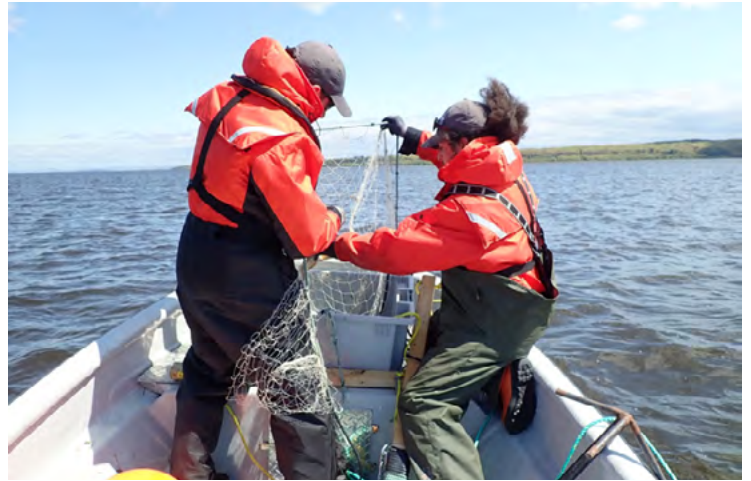
Photo: Two wildlife technicians from the Bureau du Nionwentsio using a net in the context of inventory work on the St. Lawrence River.

the capture and measurement of fish, but also the collection of physico-chemical data at the mouth of a river for potential spawning. Despite numerous efforts, no spawning grounds were detected in 2019. The knowledge acquisition efforts undertaken by the Bureau du Nionwentsio will continue for at least the next two years.