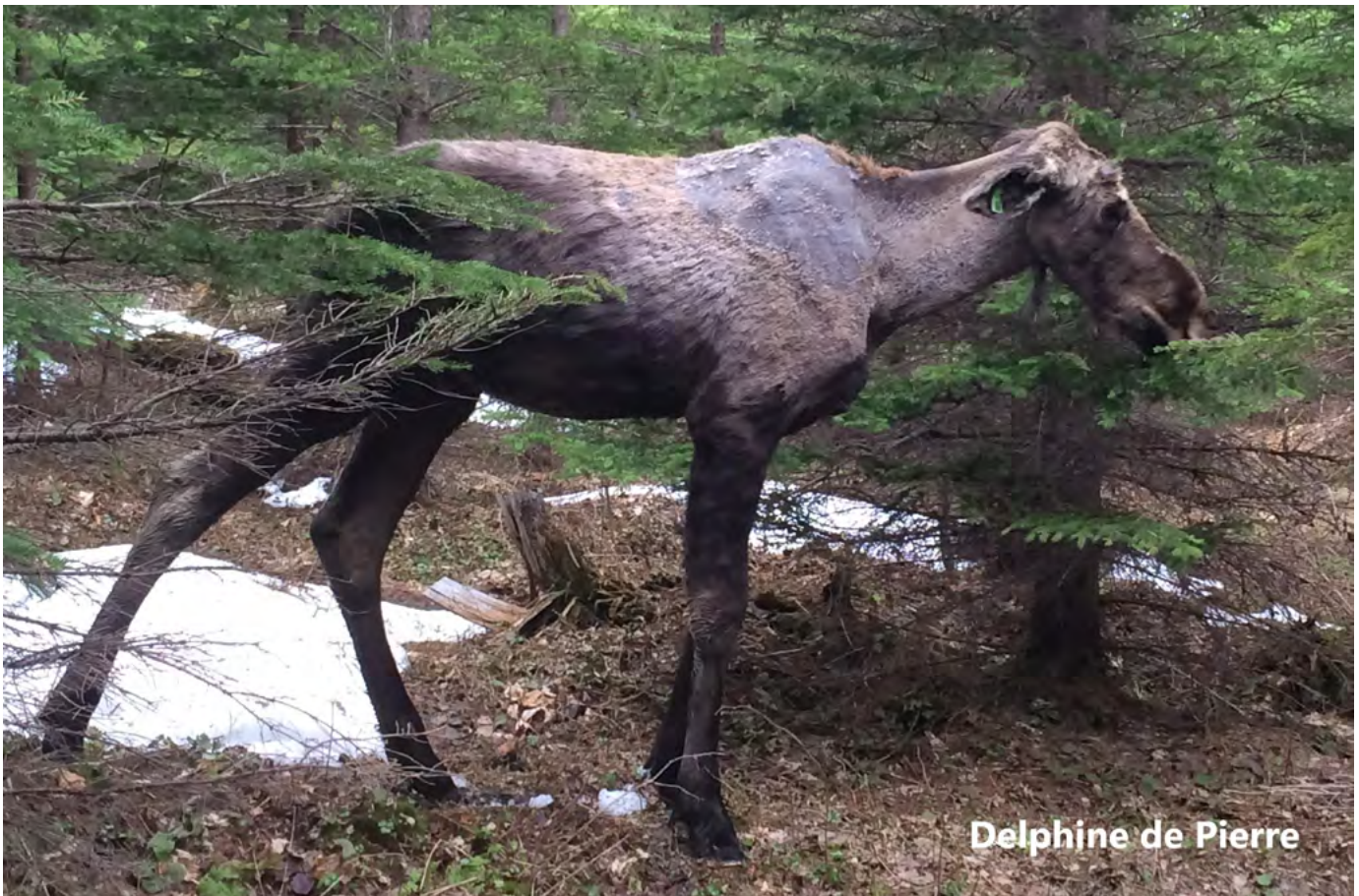
Delphine de Pierre

For more information, please contact Florent Déry at the following email address: toc@bio.ulaval.ca