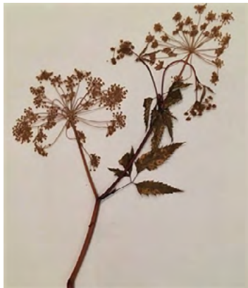
Cow parsnip (poglus)

Cow parsnip ( Heracleum maximum ), which the Huron-Wendat refer to as “poglus”, is a plant that has extraordinary medicinal properties. Found mainly along roads and streams, it is known to be used as a flu remedy. Moreover, here is an interesting historical fact: poglus was successfully used by the Huron-Wendat of Wendake to fight the Spanish flu epidemic that raged in Quebec in 1918. Thanks to this traditional medicinal knowledge that has been passed on from generation to generation, the Huron-Wendat continue to treat fever and flu with poglus to this day.