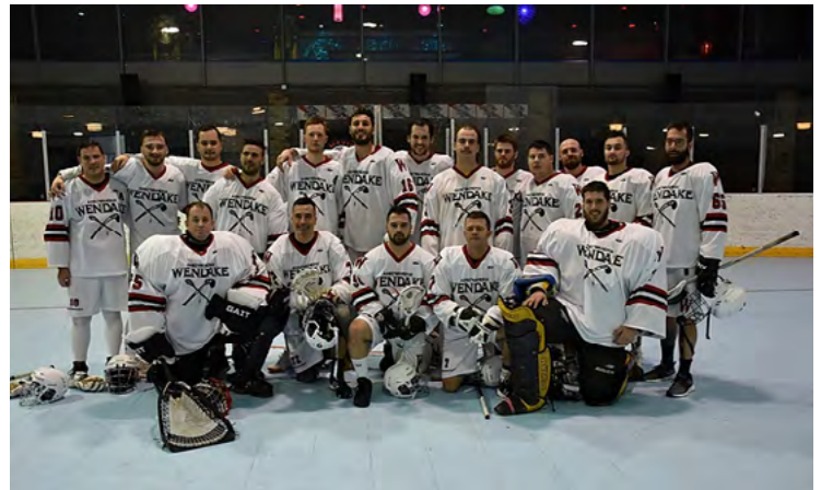
Wendake's Ahki'wahcha' lacrosse team at the 2020 Sin City Box Classic