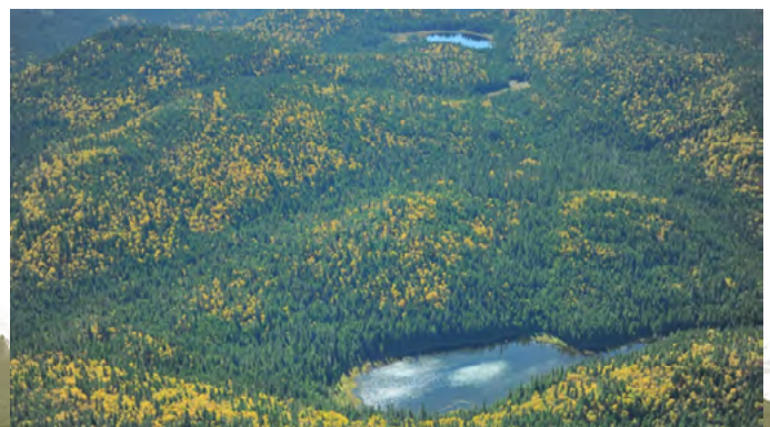
An aerial view of the untouched forest expanse in the Moïse Lake region