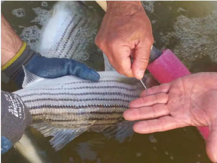
Photo : Prélèvement d'écaillés sur un bar rayé lors d'une collaboration entre le Bureau du Nionwentsio et Englobe

origin of the current population is a cause for uncertainty about the status of the population. Although the population appears to be gradually recovering, COSEWIC, a committee of experts tasked with assessing the status of wildlife in Canada, determined in 2019 that the original population had disappeared. Certainly, activities aimed at better understanding the striped bass of the St. Lawrence and identifying and reducing the threats to its recovery must continue.