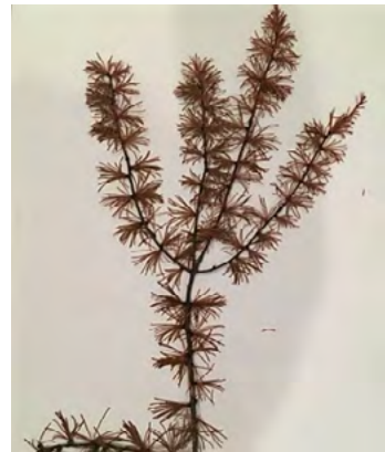
Tamarack (red larch)

Finally, the research team has also created brochures to share the information collected and also facilitated a workshop at Wahta' Elementary School. These activities aim to take part in any type of project that affects the health of members, the transmission of knowledge and the practice of its customary activities on the Nionwentsio in the context of climate change. In the same vein, a second article will present two important plants in the history of the Huron-Wendat people, namely cow parsnip – poglus ( Heracleum maximum ) and the savoyane – threeleaf goldthread ( Coptis trifolia ).