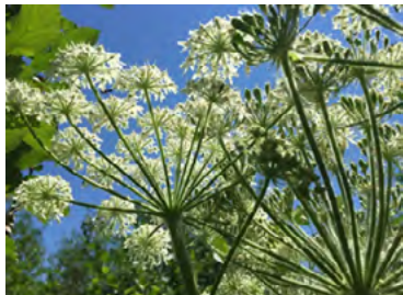
Cow parsnip (poglus)